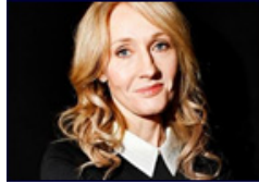
An Open Letter to JK Rowling