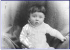
Killing Baby Hitler: A Jewish Response