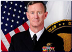
6 Lessons on Changing the World