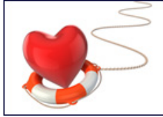
The Top 17 Pieces of Marital Advice

Give Tzedakah! Help Aish.com create inspiring articles, videos and blogs featuring timeless Jewish wisdom.